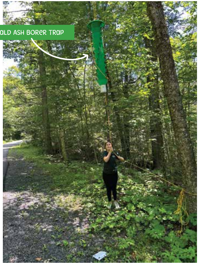
EMERALD ASH BORER TRAP

While monitoring a District tree planting site, interns observed D-shaped holes in ash trees at the Champlain Area Trails (CATS) Beaver Bend Nature Preserve in Westport. They placed a trap on site and caught what appeared to be Emerald Ash Borers. The NYSDEC confirmed this identification. When ash trees become infested with this invasive pest they typically die in 2-4 years. You can learn more about the Emerald Ash Borer on the NYSDEC website.